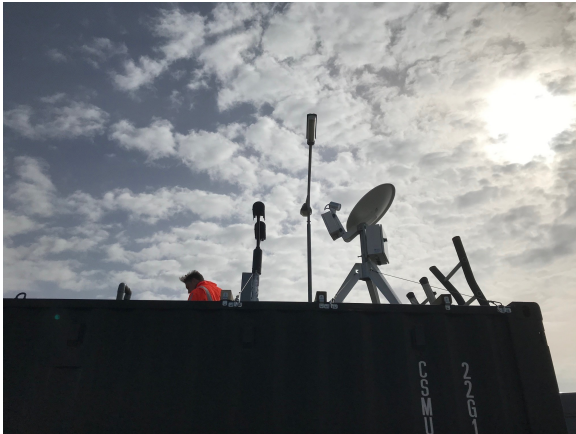
Ruisdael observatory site at Slufter, in the Port area of Rotterdam.

Raindrops come in different sizes. Some are more efficient at picking up air pollutants.