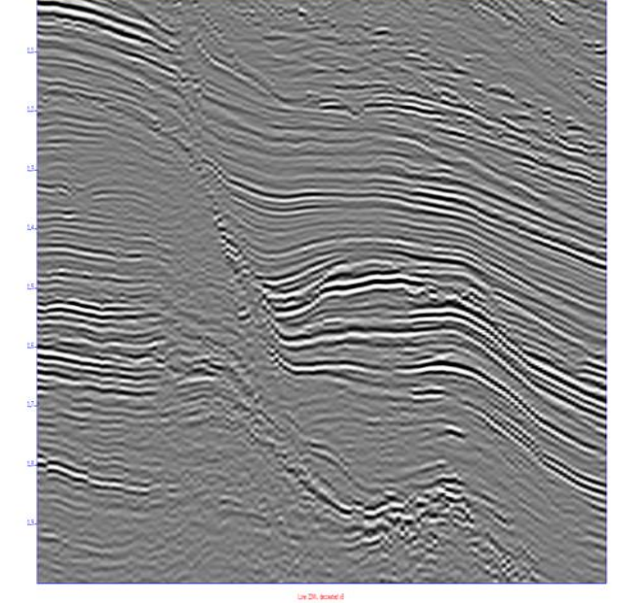
Figure 1: Original and decimated stack (factor 5 decimation)