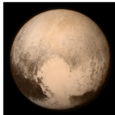
Pluto, as photographed by the New Horizons spacecraft on July 13, 2015, after a 5 billion kilometre journey.