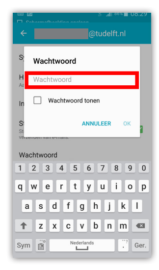
Step 7. Enter your new password and tap OK.