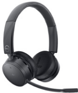
Dell Pro Wireless Headset - WL5022

Multi-task seamlessly across 3 devices with this premium full-size keyboard and sculpted mouse combo featuring programmable shortcuts and 36 months battery life.