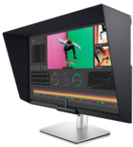
Dell UltraSharp 32 HDR PremierColor Monitor - UP3221Q

Create phenomenal 4K HDR content on the world's first professional monitor with 2K mini-LED direct backlit dimming zones.*