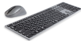
Dell Premier Multi-Device Wireless Keyboard and Mouse - KM7321W

Elevate your productivity on this innovative 27-inch QHD Hub monitor with a wide color coverage including DCI-P3. Features ComfortView Plus an always-on built-in low blue light screen, USB-C with up to 90W power delivery, and RJ45 connectivity.