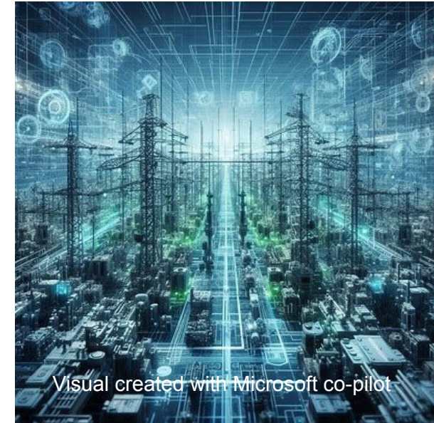
Visual created with Microsoft co-pilot