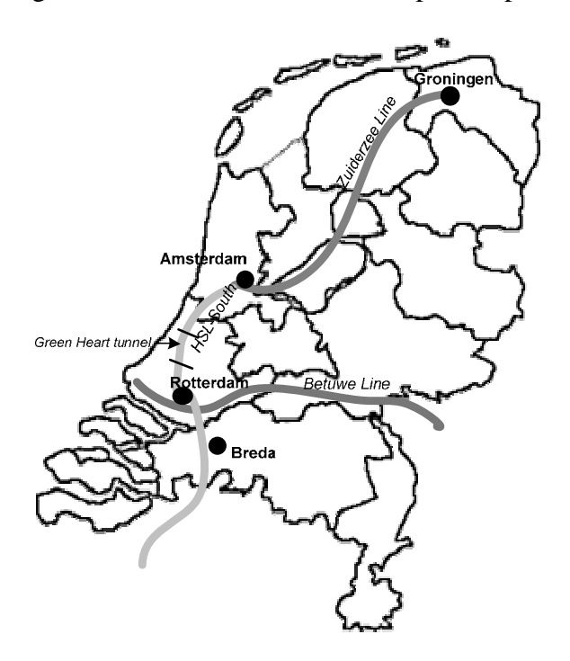
Figure 1. Indication of the three projects in the Netherlands

resulted in a more adequate privatization approach in the case of the Zuiderzee Line. Section 7 gives an overview of the most important privatization lessons from these three projects.