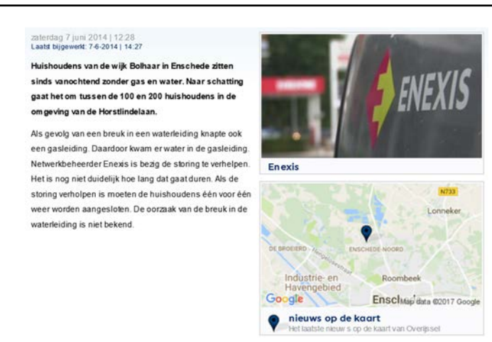
Fig. 1 News item RTV East June 2014

This assignment is a collaboration between GRS and Accenture Technology.