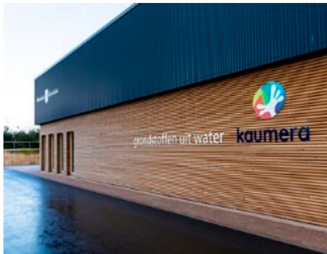
Figure 3. The Nereda® plant and the Kaumera factory in Zutphen, The Netherlands.

The gradually revealed chemical structure of Kaumera stimulates further scientific thinking: how to use sustainable biopolymers to produce high performance new materials and composites. This drives various research collaborations on Kaumera-based new material within TU Delft, in the Netherlands and internationally.