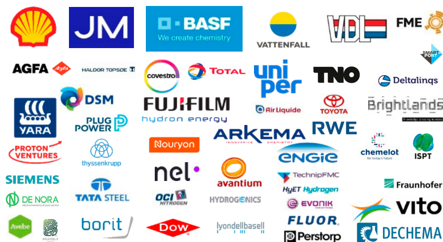
Figure A3: Snapshot of industrial parties collaborating in projects of the e-refinery institute

More importantly, the increased collaboration with our sister departments at various faculties has led to an increased number of joint master theses, joint publications, and more interaction with industry (Figure A3). The latter is highly productive, since we can thereby help shape the industrial vision of the energy transition, while industry advises us on the challenges they perceive in the energy transition.