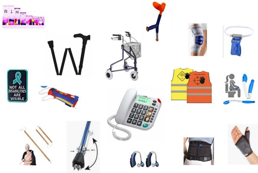
Figure 3 an overview of the artifacts used in the exercise

In collaboration with several other members of our department, we embedded the exercise in three different courses in the fall semester of 2021. 7 These courses were: the ethics of healthcare technologies, introduction to responsible innovation, and philosophy and history of science and technology. While they differ in a number of respects (see table 1), these courses share an emphasis on ethical issues in engineering and design contexts. Some of the instructors involved in these courses explicitly presented the workshop to the students as an effort to value neurodiversity in our pedagogy. Such explication can signal to students who identify as neurodiverse that “they belong,” while normalizing the idea that learning and knowledge-acquisition takes on many different shapes (Shmulsky et al. 2021). As a form of consciousness-raising, the latter can be particularly important for students who do not yet recognize their own mind as neurodivergent, but who would benefit from such acknowledgment. 8