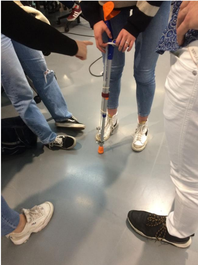
Figure 7 Embodied engagement with the artifacts, resulting in specific design choices

These considerations emphasized the ethics domain and its relationship to technology. One of the questions asked during the interview was: “Do you believe that working with the artifact as you did right now in the workshop has somehow changed – what I could call – your moral sensitivity? Has it made you more sensitive to, well, the moral values that are embedded already in the artifact, and what you could change, and so on? The interviewees responded as follows: