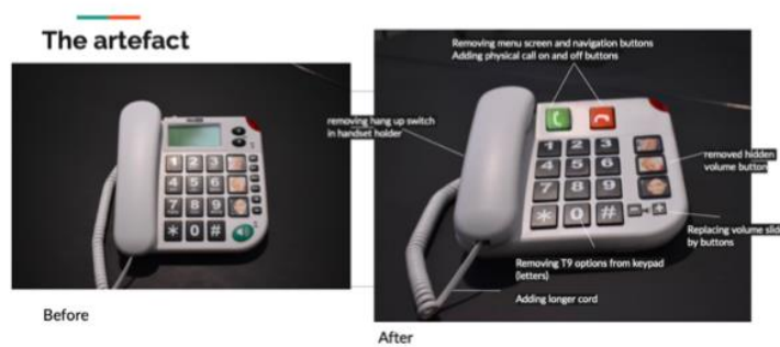
Figure 8 Picture memory phone before and after modifications

“One of the most motivated groups that took the assignment very seriously; one of the students’ mother worked as a nurse with people with Alzheimer. During the workshop, they called her (several times, I believe) in order to make the best design choices. Her recommendation in nutshell was to get rid of anything unnecessary.”