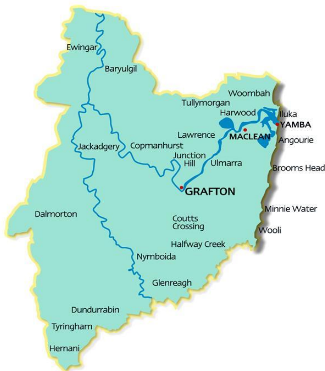
Map of Clarence Valley, located at the east coast of Australia.