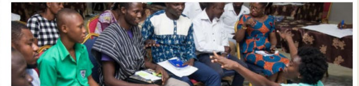
COLLECTION Transnational Citizens' Assemblies