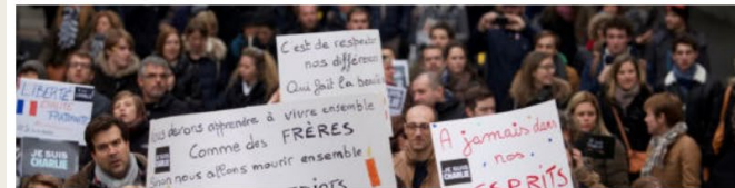
COLLECTION Transnational Social Movements