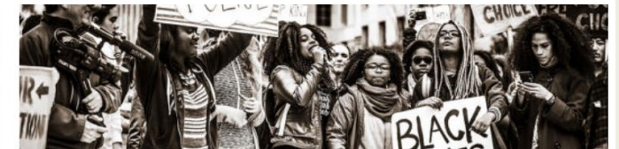
COLLECTION Public Participation for Racial Justice