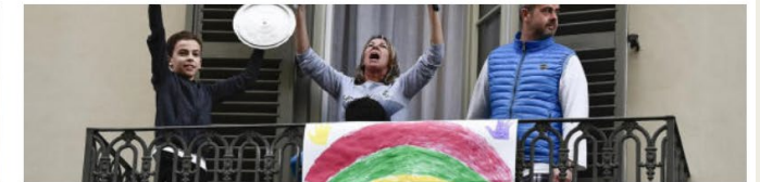
FEATURED COLLECTION Covid-19 Response