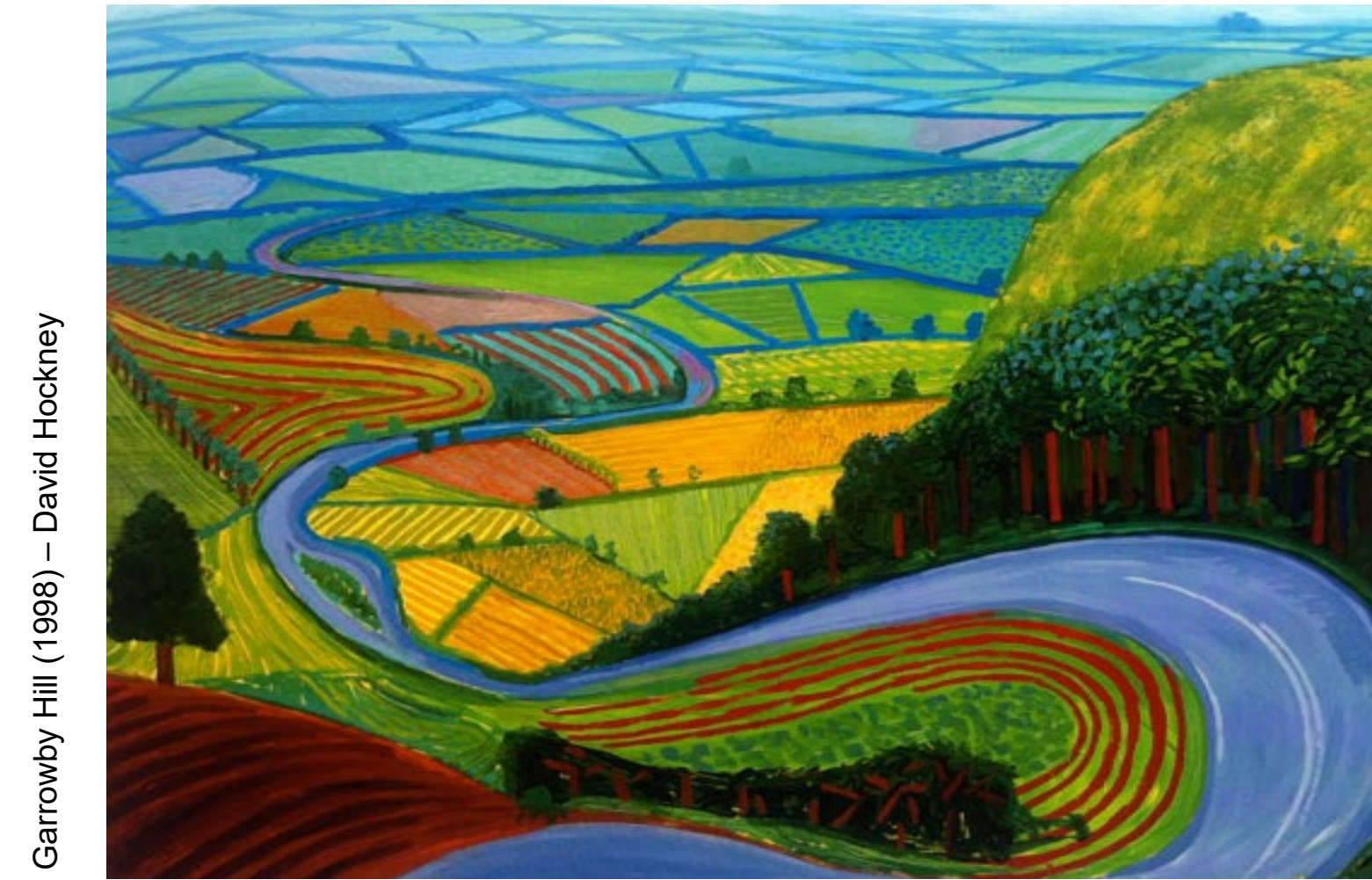
Garrowby Hill (1998) – David Hockney